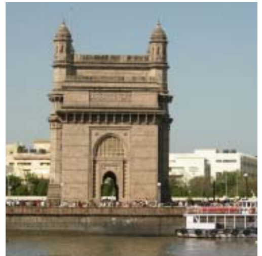
Gateway of India, backdrop for the on-water display.